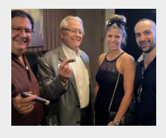
<u>Chamber</u> <u>Connections:</u> <u>Cigar Night</u> April 25