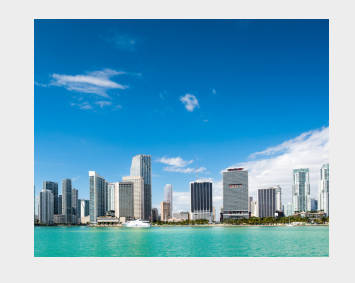
8th Annual Resilient Solutions Summit May 3