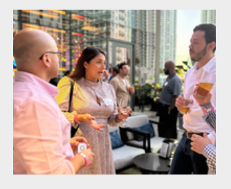
Chamber Connections May 23