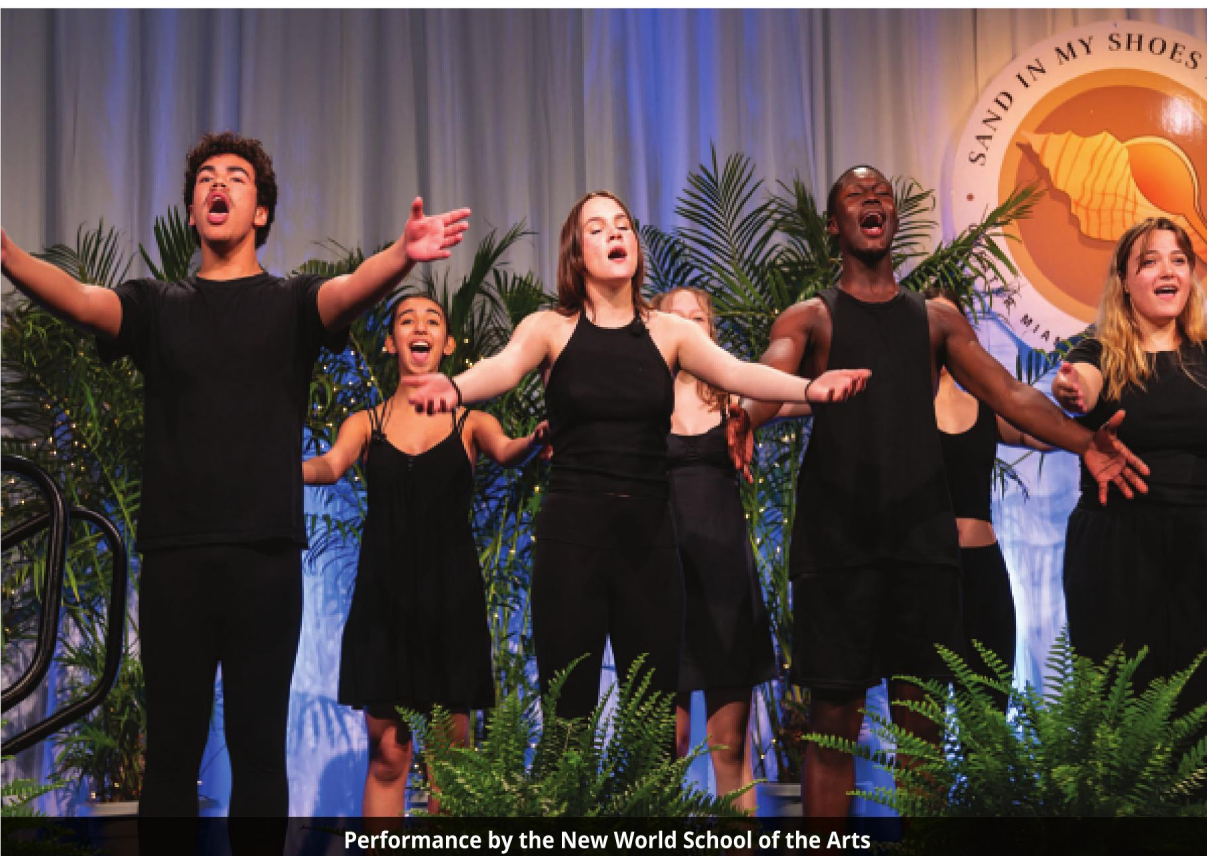
Performance by the New World School of the Arts