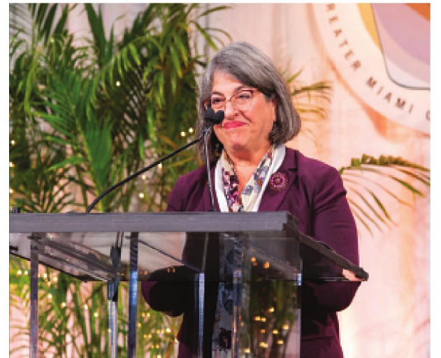
Daniella Levine Cava, Mayor, Miami-Dade County