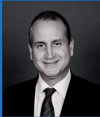
CONGRESSMAN MARIO DIAZ-BALART DISTRICT 26