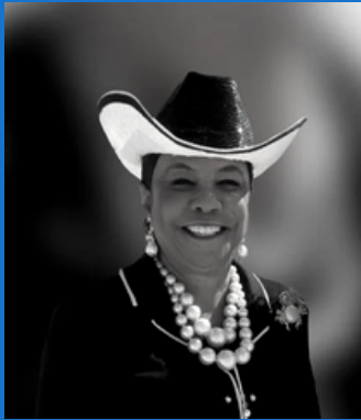
CONGRESSWOMAN FREDERICA WILSON DISTRICT 24