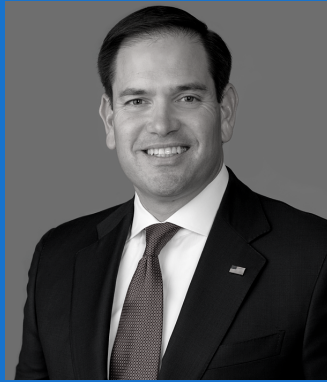
SENATOR MARCO RUBIO STATE OF FLORIDA