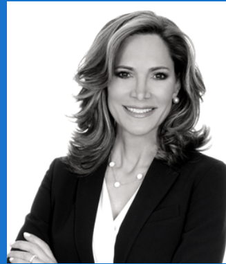
CONGRESSWOMAN MARIA ELVIRA SALAZAR DISTRICT 27