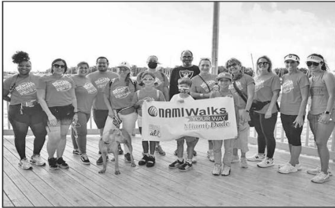
PARTICIPANTS GET READY FOR THE NAMI MIAMI-DADE MENTAL HEALTH AWARENESS WALK.