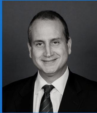
CONGRESSMAN MARIO DIAZ-BALART DISTRICT 26