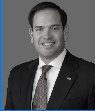
SENATOR MARCO RUBIO STATE OF FLORIDA