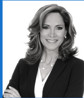
CONGRESSWOMAN MARIA ELVIRA SALAZAR DISTRICT 27