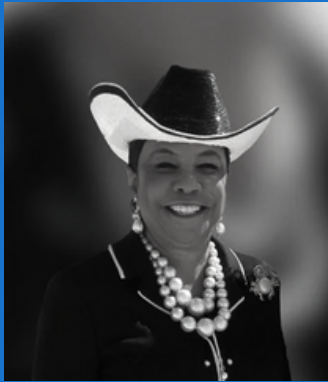
CONGRESSWOMAN FREDERICA WILSON DISTRICT 24