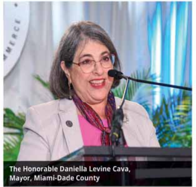
The Honorable Daniella Levine Cava, Mayor, Miami-Dade County